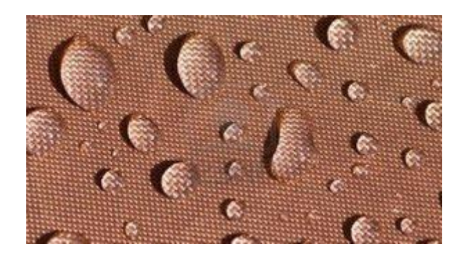
Water proof fabric