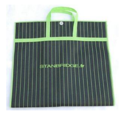
Moth proof finished bag

It is mainly carried out on wool fabrics as the keratin molecules are consumed by moths as food. Since woolen fabrics are costlier, they have to be protected from moth. Moth is a small insect that feeds on substances like keratin and fibroin and so animal fibres are more susceptible to the attack of moth.