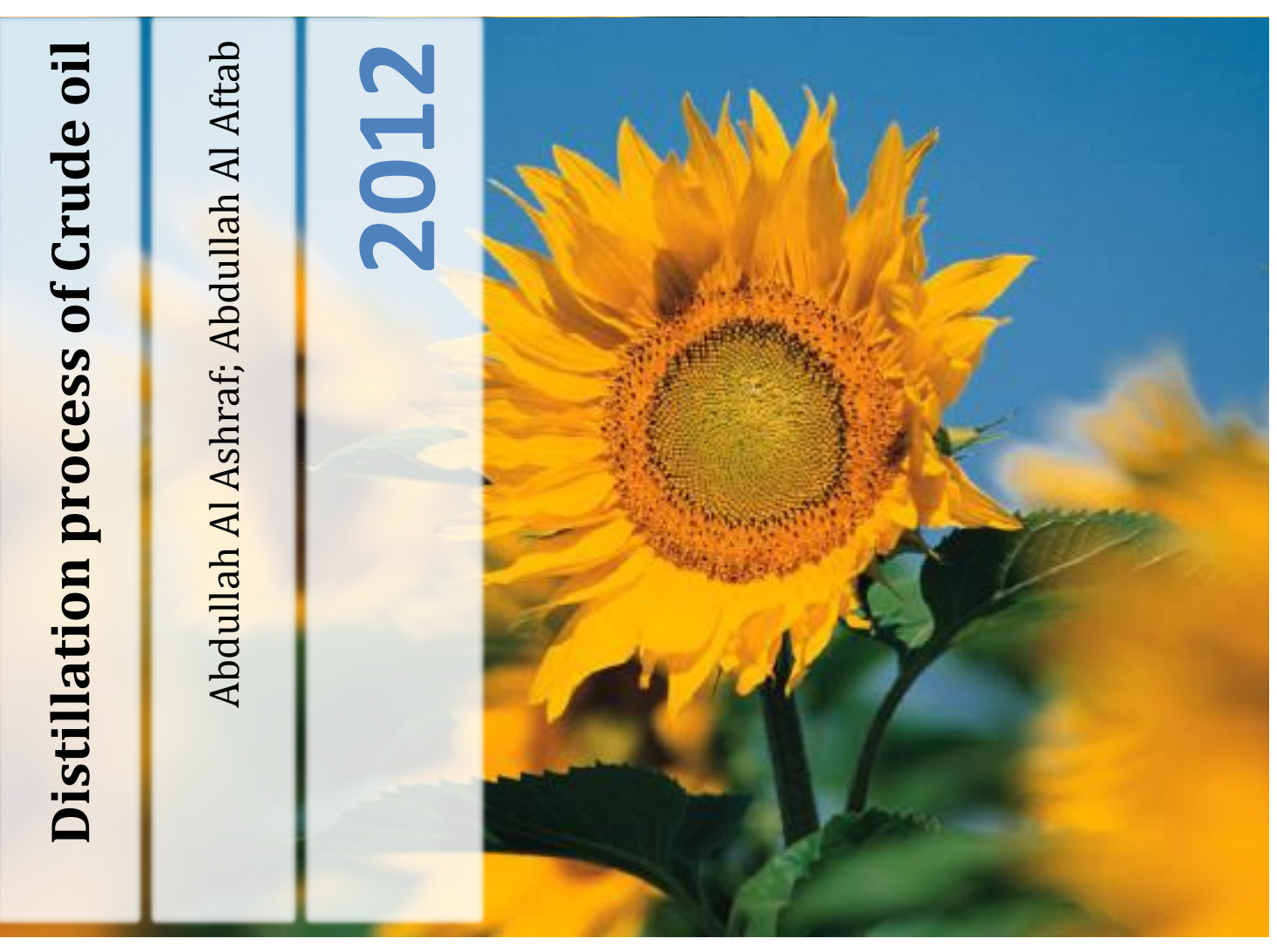
Crude oil is a fossil fuel, it was made naturally from decaying plants and animals living in ancient seas millions of years ago most places you can find crude oil were once sea beds. Crude oils vary in color, from clear to tar-black, and in viscosity, from water to almost solid. The distillation process of Crude oil is the main concern of this paper. Here, we reported the ideas of different processes of distillations and their steps.