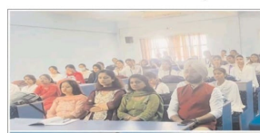
Students participating in the International Women's Day celebration.

Jammu, March 8 The Department of Home Science, P.S.P.S. Government College for Women Gandhi Nagar, celebrated International Women's Day on 8th March 2022. The event was organized by the Department of Home Science, P.S.P.S. Government College for Women Gandhi Nagar. The event was a great success, with students showcasing their skills and creativity. The event was a wonderful opportunity for students to learn about the importance of women and to showcase their own skills and creativity. The event was a great success, with students showcasing their skills and creativity. The event was a wonderful opportunity for students to learn about the importance of women and to showcase their own skills and creativity.