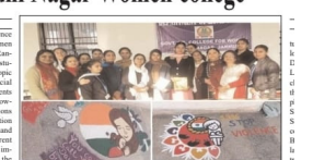
Students participating in the Rangoli Making Competition.

Jammu, Nov 27 The Department of Home Science, P.S.P.S. Government College for Women Gandhi Nagar, conducted a Rangoli Making Competition on 25th November 2022. The competition was organized by the Department of Home Science, P.S.P.S. Government College for Women Gandhi Nagar. The competition was a great success, with students showcasing their skills and creativity. The competition was a wonderful opportunity for students to learn about rangoli making and to showcase their own skills and creativity. The competition was a great success, with students showcasing their skills and creativity. The competition was a wonderful opportunity for students to learn about rangoli making and to showcase their own skills and creativity.