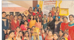
Students showcasing their traditional crafts and culture at the J&K Hunar Fest.