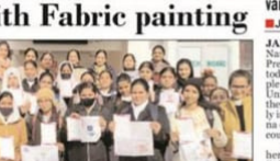
Students participating in the Fabric Painting Workshop.

Jammu, Dec 28 The Department of Home Science, P.S.P.S. Government College for Women Gandhi Nagar, organized a Fabric Painting Workshop on 28th December 2022. The workshop was organized by the Department of Home Science, P.S.P.S. Government College for Women Gandhi Nagar. The workshop was a great success, with students showcasing their skills and creativity. The workshop was a wonderful opportunity for students to learn about fabric painting and to showcase their own skills and creativity. The workshop was a great success, with students showcasing their skills and creativity. The workshop was a wonderful opportunity for students to learn about fabric painting and to showcase their own skills and creativity.