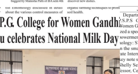
Students participating in the National Milk Day celebration.

Jammu, Nov 27 The Department of Home Science, P.S.P.S. Government College for Women Gandhi Nagar, celebrated National Milk Day on 25th November 2022. The event was organized by the Department of Home Science, P.S.P.S. Government College for Women Gandhi Nagar. The event was a great success, with students showcasing their skills and creativity. The event was a wonderful opportunity for students to learn about the importance of milk and to showcase their own skills and creativity. The event was a great success, with students showcasing their skills and creativity. The event was a wonderful opportunity for students to learn about the importance of milk and to showcase their own skills and creativity.