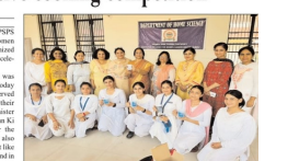
Students participating in the Creative Cooking Competition.

Jammu, Nov 27 The Department of Home Science, P.S.P.S. Government College for Women Gandhi Nagar, conducted a Creative Cooking Competition on 25th November 2022. The competition was organized by the Department of Home Science, P.S.P.S. Government College for Women Gandhi Nagar. The competition was a great success, with students showcasing their skills and creativity. The competition was a wonderful opportunity for students to learn about creative cooking and to showcase their own skills and creativity. The competition was a great success, with students showcasing their skills and creativity. The competition was a wonderful opportunity for students to learn about creative cooking and to showcase their own skills and creativity.