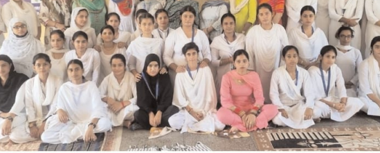
Students participating in a yoga session organized by the Department of Home Science.