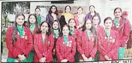
NCC cadets from J&K who brought laurels during RDC 2023.