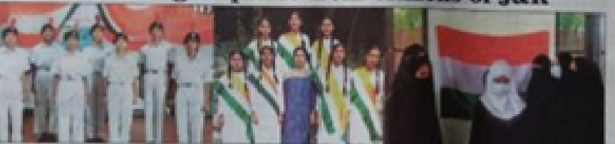
Students across Jammu & Kashmir (J&K) enthusiastically participating in National Anthem Singing competition.