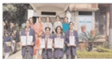
Naval NCC cadets of PSps GCW Gandhi Nagar college attend NAU Sainik Camp

Four Naval NCC cadets of Padma Shri Padma Sachdev Government PG College for Women, Gandhi Nagar, Jammu, were part of team comprising of 17 cadets from 1 J&K Naval Unit (NCC) who represented Jammu, Kashmir and Ladakh (JKL) in the National NCC Cadet Competition (NCCCC) held in New Delhi on Oct 18-20, 2022. A total of 17 cadets from across the country attended the camp and competed in various events like Boat Pulling, Ship Modelling, Drill, Navigation, Survival Subject, Teamwork, and many others.